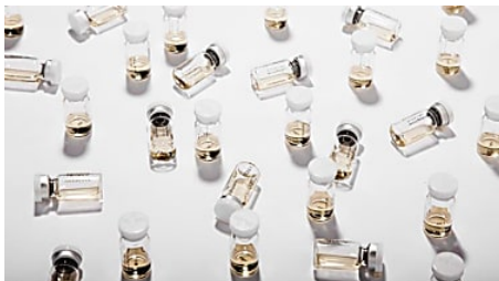
Meet The Mask Taking The Beauty Industry By Storm