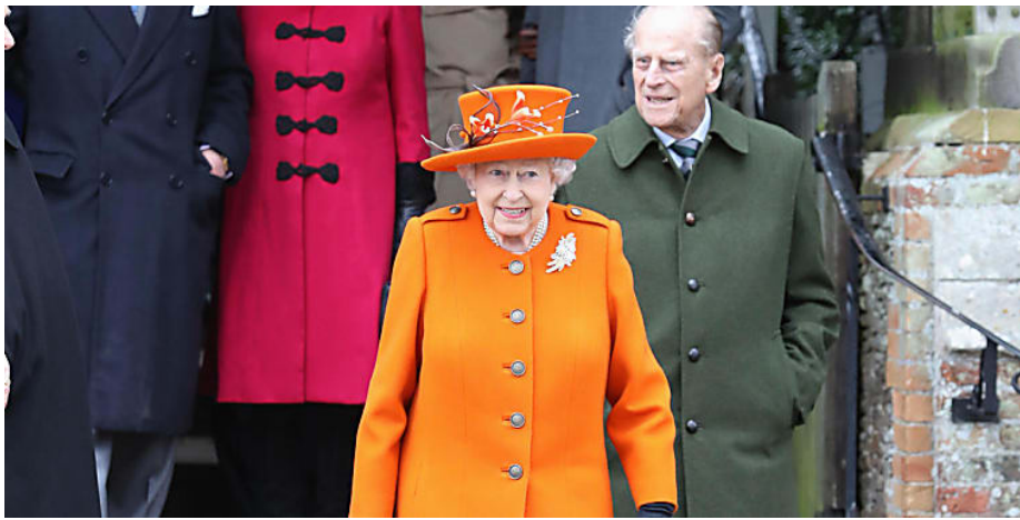
Royal wedding: Queen Elizabeth gives consent for Prince Harry and Meghan Markle's marriage