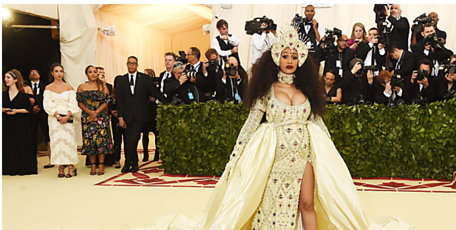
Met Gala 2018 red carpet