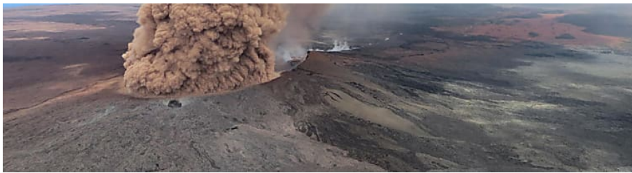
Volcanic eruption in Hawaii