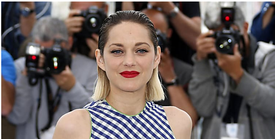
2018 Cannes Film Festival