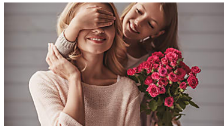
You Will Not Believe Living Social's Mother's Day Deals for Sunday