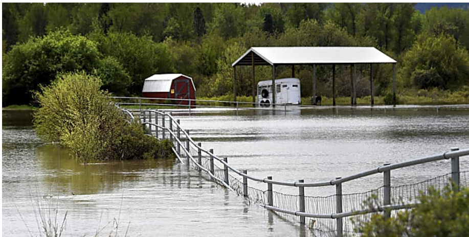
Montana's Clark Fork River crests at highest level in a century